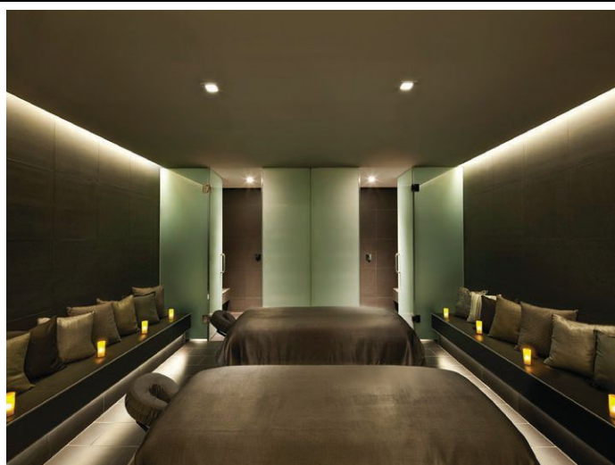
Unwind with your other half in The Rittenhouse Spa & Club's couple's massage therapy room.

Located in The Rittenhouse, this luxurious spa and salon offers an expansive selection of massages, skincare and body treatments to pamper and primp every client to the fullest. Candles light the way as you wander throughout the airy 3,000-square-foot space—take in the peaceful atmosphere while unwinding on plush couches. For those who miss their skin's prewinter dewy glow, book a HydraFacial, MD, which hydrates, refreshes and minimizes lines with LED light therapy. 210 W. Rittenhouse Square, 215.790.2500, therittenhousespaclub.com